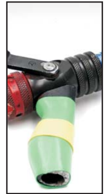
HM690GRN-KIT PISTOL GRIP COVER KIT GREEN W/YELLOW STRIPE

Deicing RED w/Yellow Stripe (TFT Part # HM690RED-KIT)