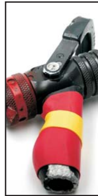
HM690RED-KIT PISTOL GRIP COVER KIT RED W/YELLOW STRIPE