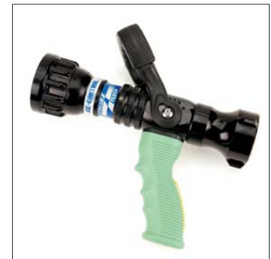
HM694GRN-KIT GREEN W/YELLOW STRIPE GRIP

Instructions will be included in each kit which will be packaged in a small zip-lock bag. The instructions will explain both the new style and old style grips and proper installation for each.