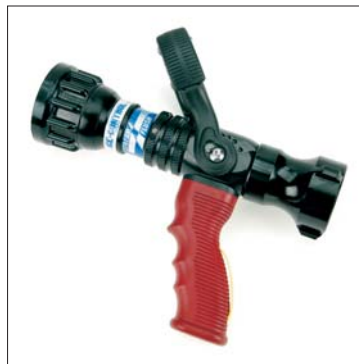
HM694RED-KIT RED W/YELLOW STRIPE GRIP

Anti-icing GREEN w/Yellow Stripe (TFT Part # HM694GRN-KIT)