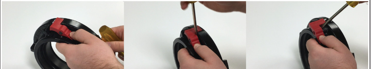
STEP 1 - Use a large flat screwdriver to push the lever off its post while maintaining the lever in the down position