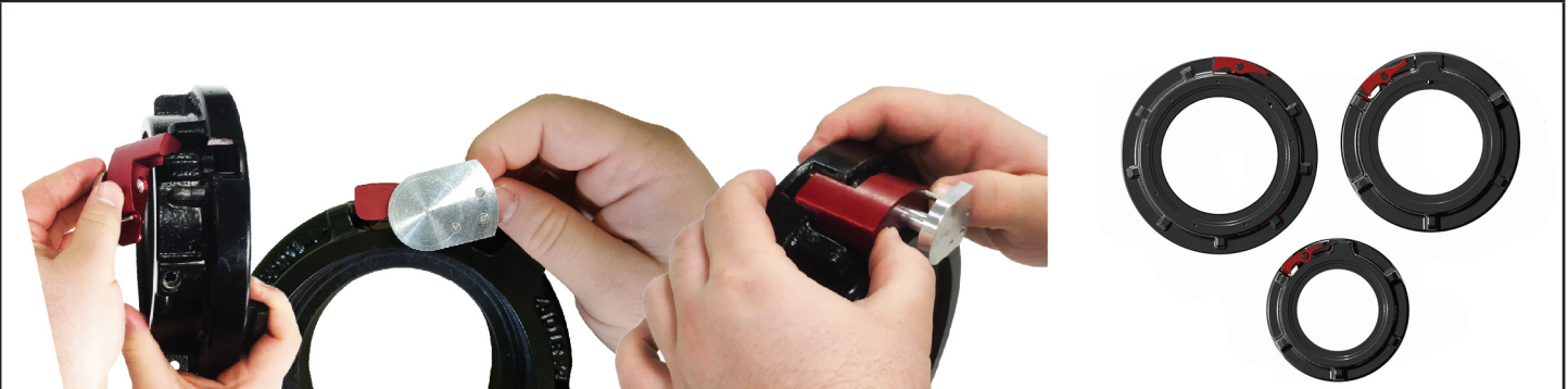
STEP 3 - Align the storz tool with the cylindrical post on the storz coupling. While holding the coupling use both thumbs to press lever until it is fully seated. Operate the lock several times to insure free movement.

TASK FORCE TIPS LLC MADE IN USA • tft.com