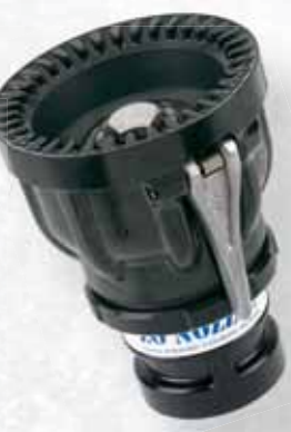
ZO series for flows up to 2500 gpm (9500 l/min)