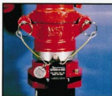
Akron Apollo® Option 2

Another way of using Extend-A-Gun with your previously purchased Apollo® is to use the threaded flange of the 3422 or 3412 monitor. However, the flange portion will need to be machined away to provide needed clearance for the Extend-A-Gun to be operated. This can be accomplished in department repair facilities or at a local machine shop. Appearance is better and operation is enhanced by using this method.