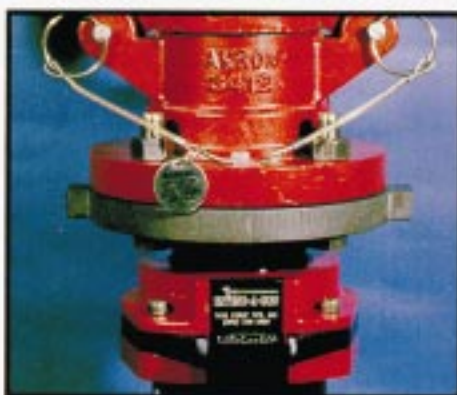
Akron Apollo® Option 1

Installation with the Apollo® is equally easy to accomplish. After Extend-A-Gun installation, thread a companion flange, TFT part #XFF-CPL onto the threaded section. Then bolt on the Akron flanged base in the normal manner. Make sure that the bolts and flanges do not interfere with the Extend-A-Gun operation (see detailed installation instructions).