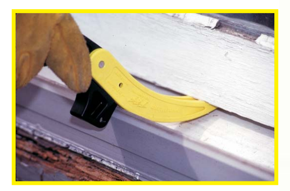
The Res-Q-Rench easily prys open windows and props doors open.