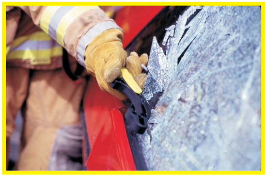
With its integrated carbide tip window punch, the Res-Q-Rench can quickly pop out windows during vehicle extrication.