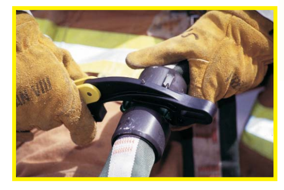
The Res-Q-Rench is designed to work with rocker lug handline and supply line couplings and is the only folding spanner that will work with 4" and 5" storz locking couplings.