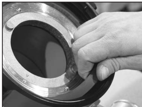
1) Remove Old Hose Gasket

Needed: new valve seat, small amount of white grease, a pointed pin, wrench, Tool #THA405 and seal retainer remover tool (available from tft if needed).