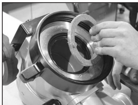
3) Remove old Valve Seat