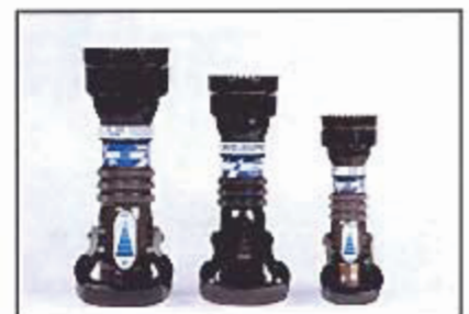
Handline - Mid-Matic - Ultimatic