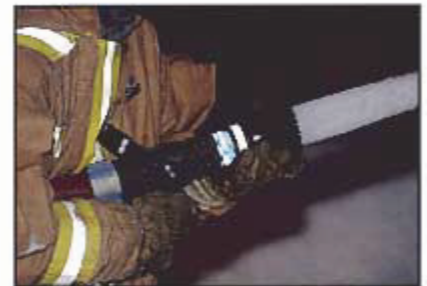
Lightweight and Compact

NFPA #1964 (1998 Edition) 2-1.5 Constant pressure (automatic) spray nozzles shall maintain their rated pressure, \pm 15 psi ( \pm 103 kPa) throughout the rated discharge range when tested in accordance with Section 4-1.