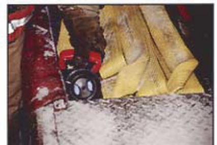
Fits easily in narrow crosslays.