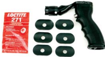
SEARCH-LITE KIT Supplied with spacers to fit most TFT Handline Nozzles.