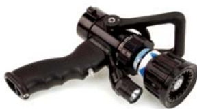
SEARCH-LITE Shown on QuadraFog