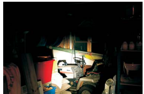
With Search-Lite, oh, it's a garage.

TASK FORCE TIPS, INC. Made in USA • www.tft.com