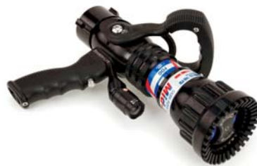
SEARCH-LITE Shown on Mid-Force