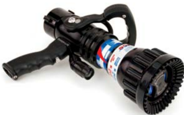
SEARCH-LITE Shown on Dual-Force