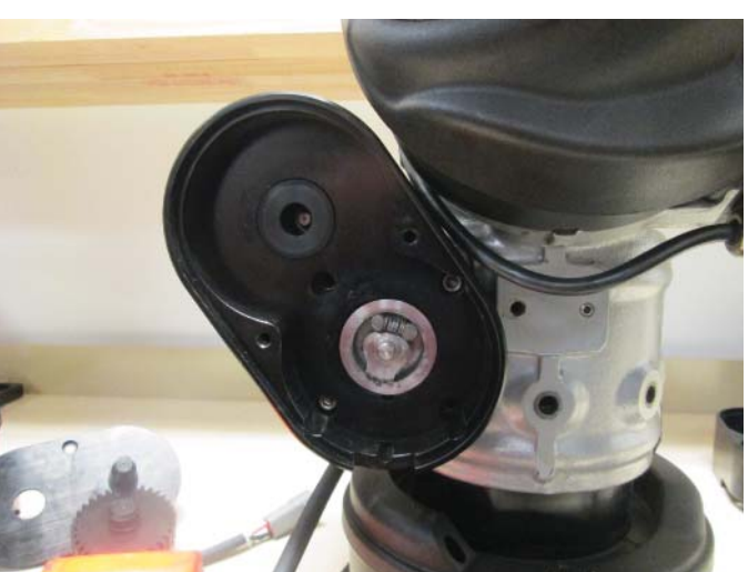
Figure 5B Monsoon Monitors